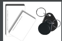
RFID Cards & Tags